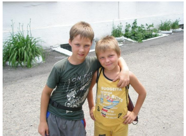
Two boys from the summer camp we helped lead in Lesozavodsk, Russia, this July.